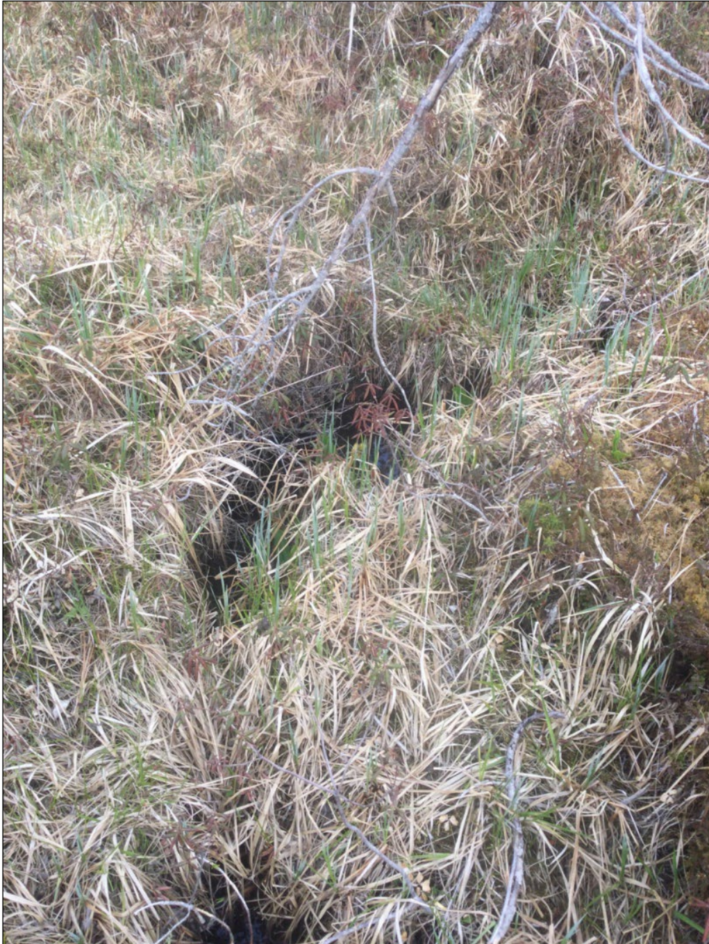
Figure 2.–Muskeg channel at waypoint 204.