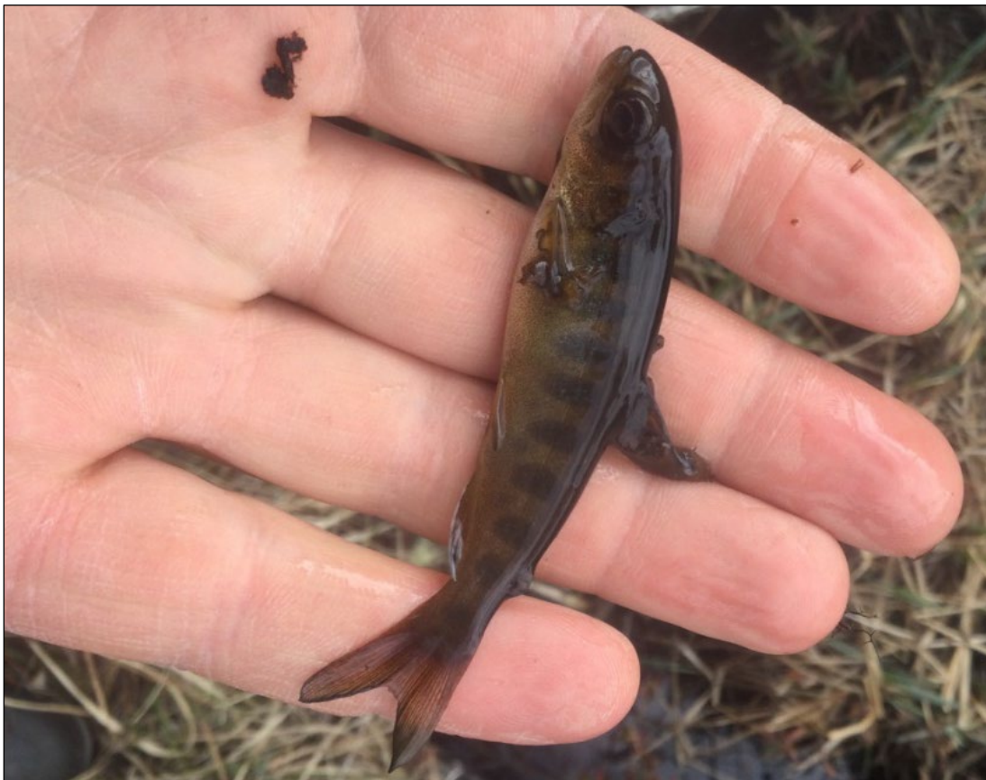
Figure 1.—Juvenile coho salmon captured at waypoint 204.